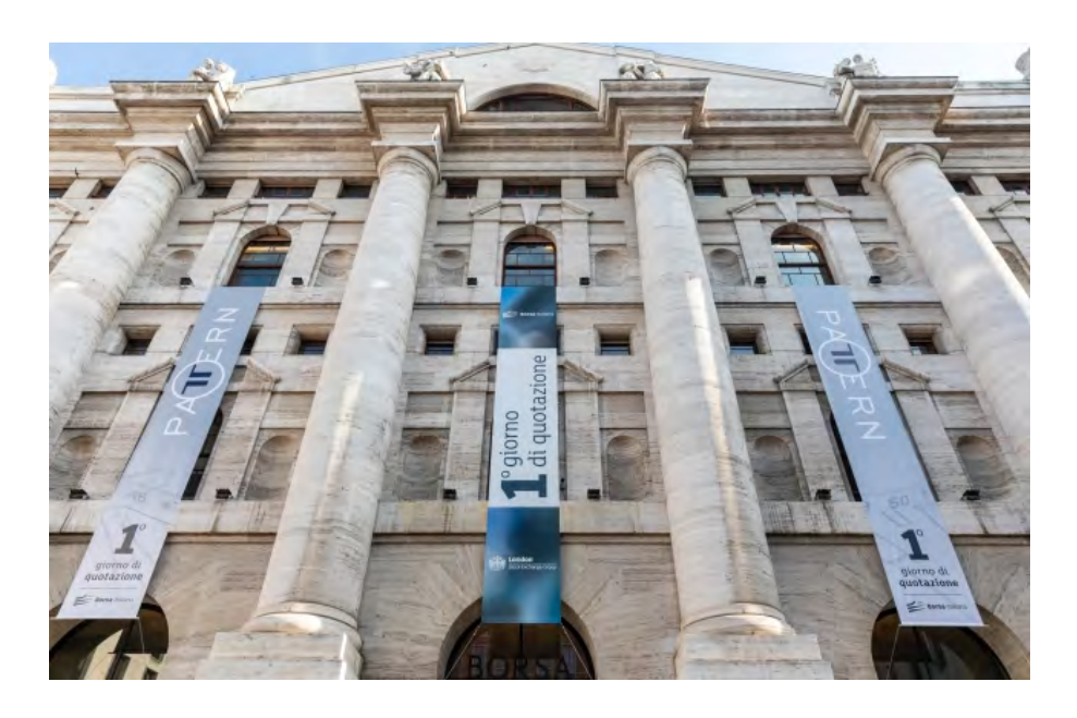
Pattern S.p.A Listed on the Italian Stock Exchange

MILAN — Italian company Pattern SpA made its debut Wednesday on <u>Aim Italia</u>, the Italian Stock Exchange's program dedicated to small and medium-size companies.